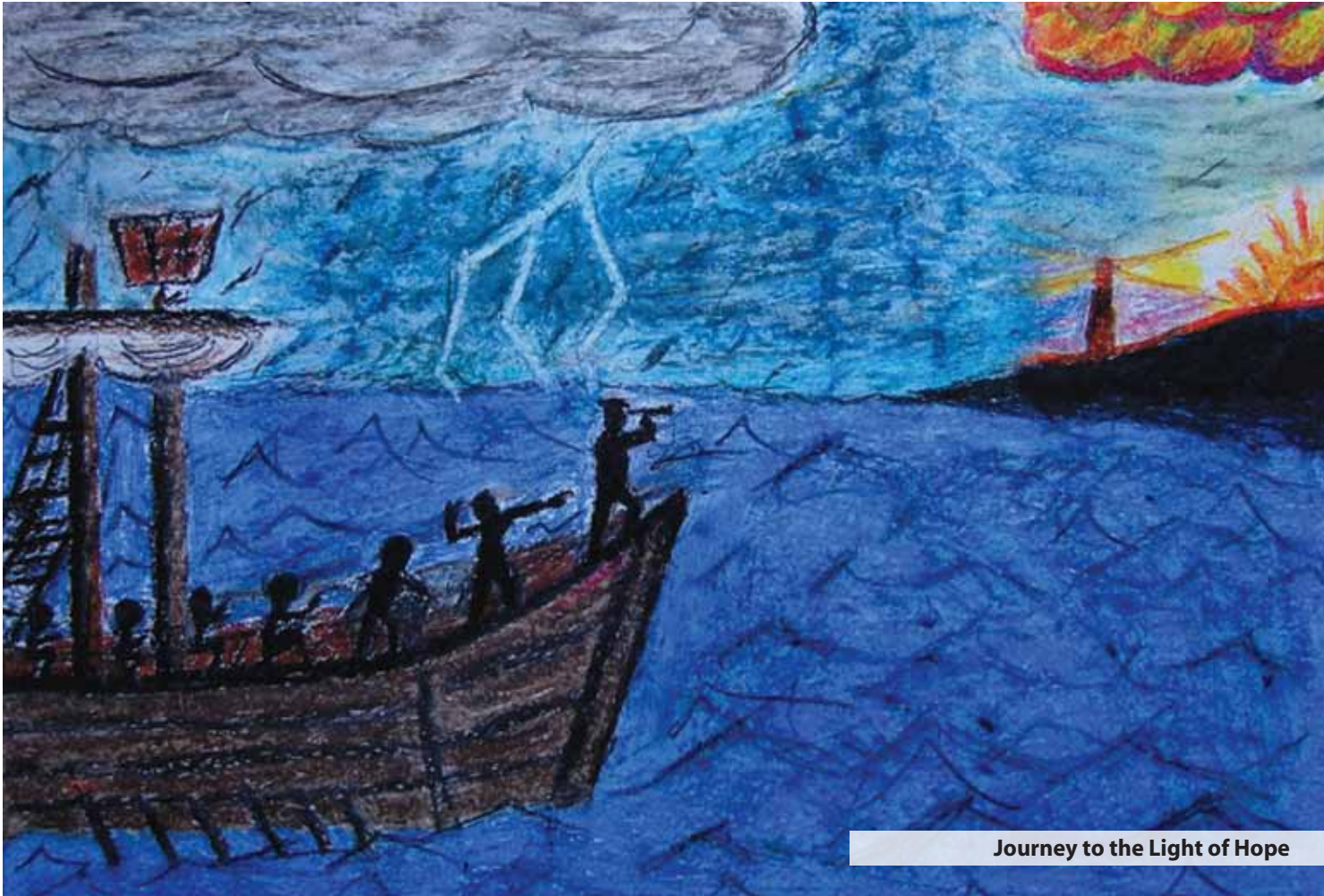
Journey to the Light of Hope

Journey to the Light of Hope depicts a ship caught in a stormy night, and the captain of the ship is leading the crew towards a safe island, which is a peaceful place covered with the warmth of the glowing sun. However, leadership is not easy. Hence, the leader is passing through a stormy night which represents the obstacles he needs to overcome. With his wisdom and experience he is inspiring the crew and providing direction. His goal is to reach the island, and therefore, the ship is moving slowly but surely, towards his goal with the participation of all the sailors. Thus, it exhibits the sense of solidarity among everyone and highlights an important part of leadership - teamwork.